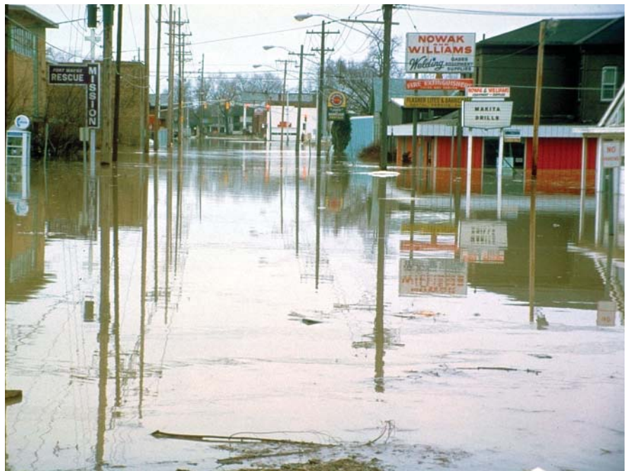
Figure 4 Faster snow melts exacerbate flooding.

Impacts of this change: Since snow causes traffic problems and requires road clearance, fewer days with snow on the ground could have a positive effect on Chicago’s infrastructure. However, fewer snow days would affect winter activities in the Chicago area. Also, faster snow melts could exacerbate flooding.