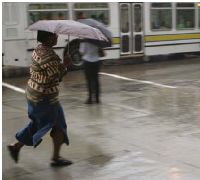
Figure 1 The number of heavy rainfalls are projected to increase over the coming century.

temperatures, increases the risk of summer drought.